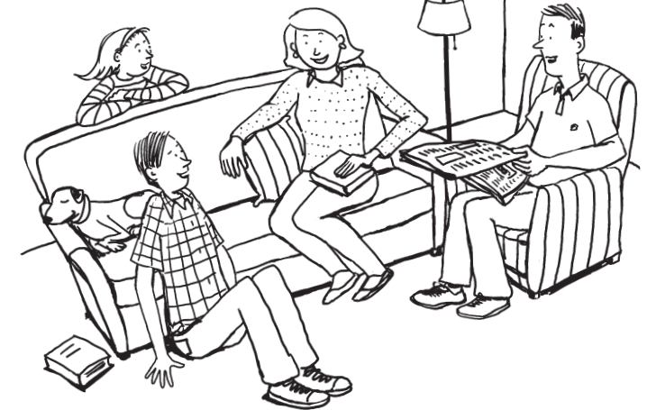
Editor's note: Guidelines are changing rapidly. Make sure to follow all local, state, and federal laws and recommendations on social distancing and other practices when using these ideas.

As a parent, you may feel overwhelmed and uncertain about what to do. Use this guide as a starting point for supporting your kids both emotionally and academically during the coronavirus pandemic.